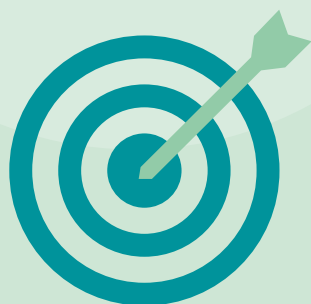
1. Developing strategic focus