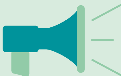
5. Advocacy approach