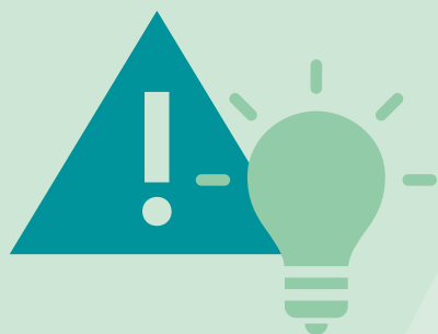
4. Risk and innovation