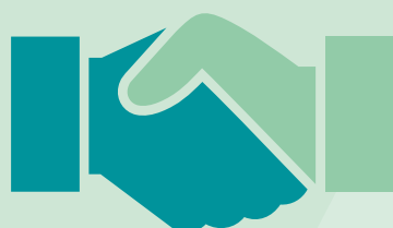
3. A partnership approach