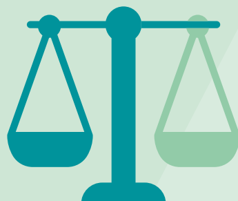
2. Values and attributes