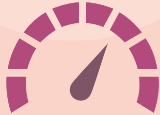
Commitment to speed