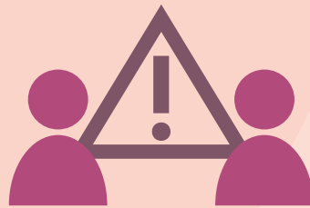
Managing risk through relationships