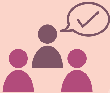
Collaborative delivery and delegated decision-making